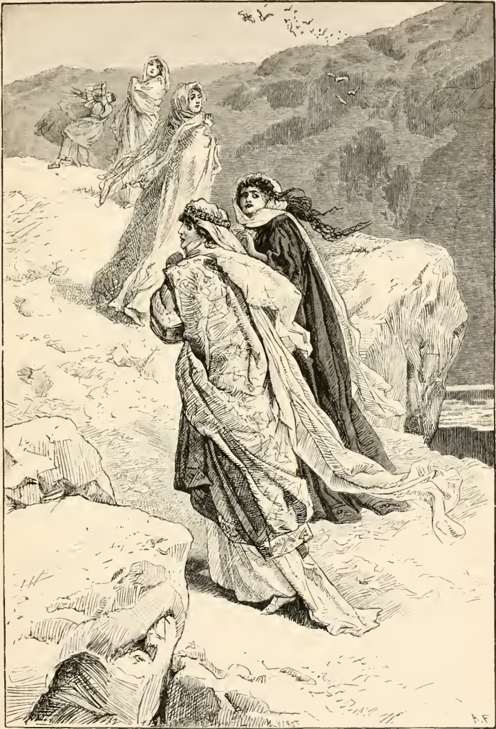
The Flight of Blodenwedd and Her Maidens.